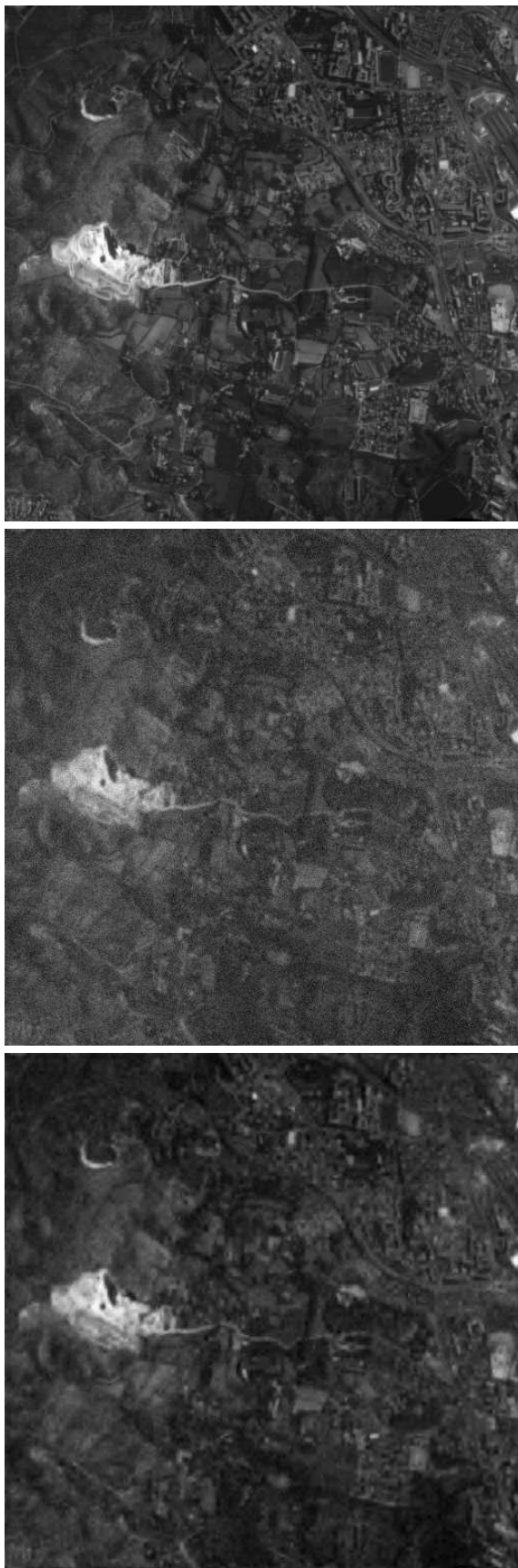
Figure 3: Original image (top), degraded image (center), and restored image (bottom).

The restored image displayed in Fig. 3 (bottom) has a relative error of 18.59 dB. Comparatively, in the same conditions, the proximity operators defined in Example 5 lead to a relative error of 18.25 dB.