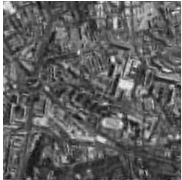
Figure 2: Original image (top), degraded image (center), and restored image (bottom).